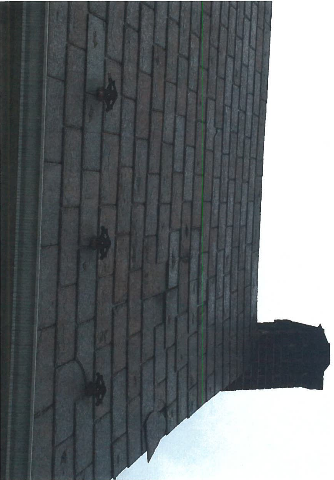
Close up view showing a section of damaged slates. Many nail holes can also be seen.