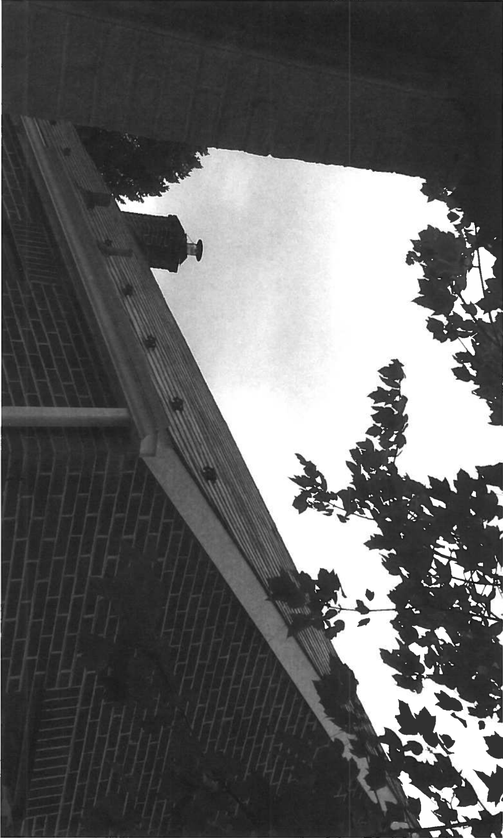
View of other side of home with slates which need to be replaced.