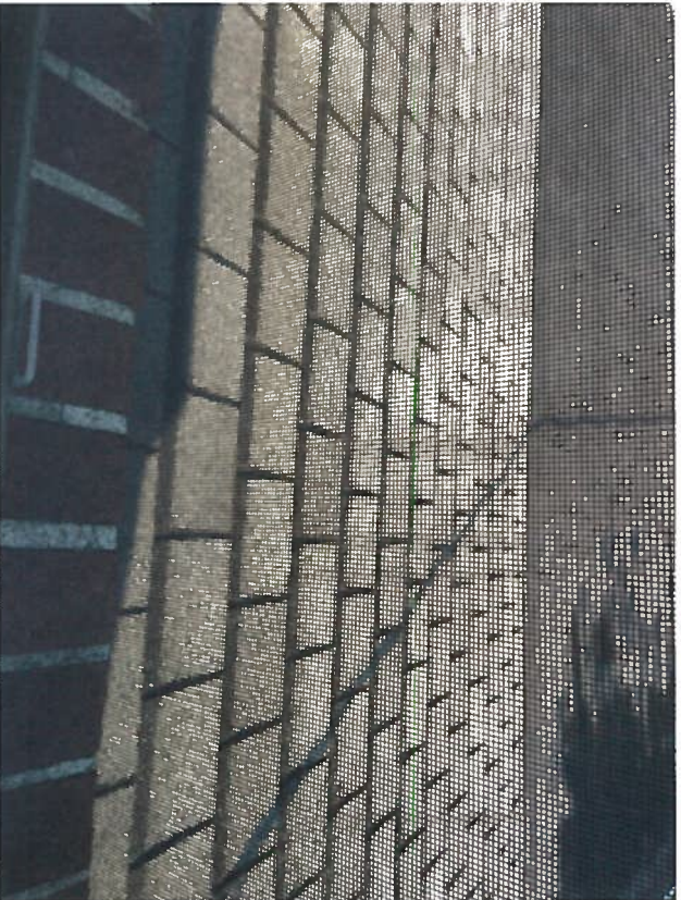
Examples of GAF Slateline Premium Shingles already existing at home entryway (left) and 2016 kitchen addition (right)