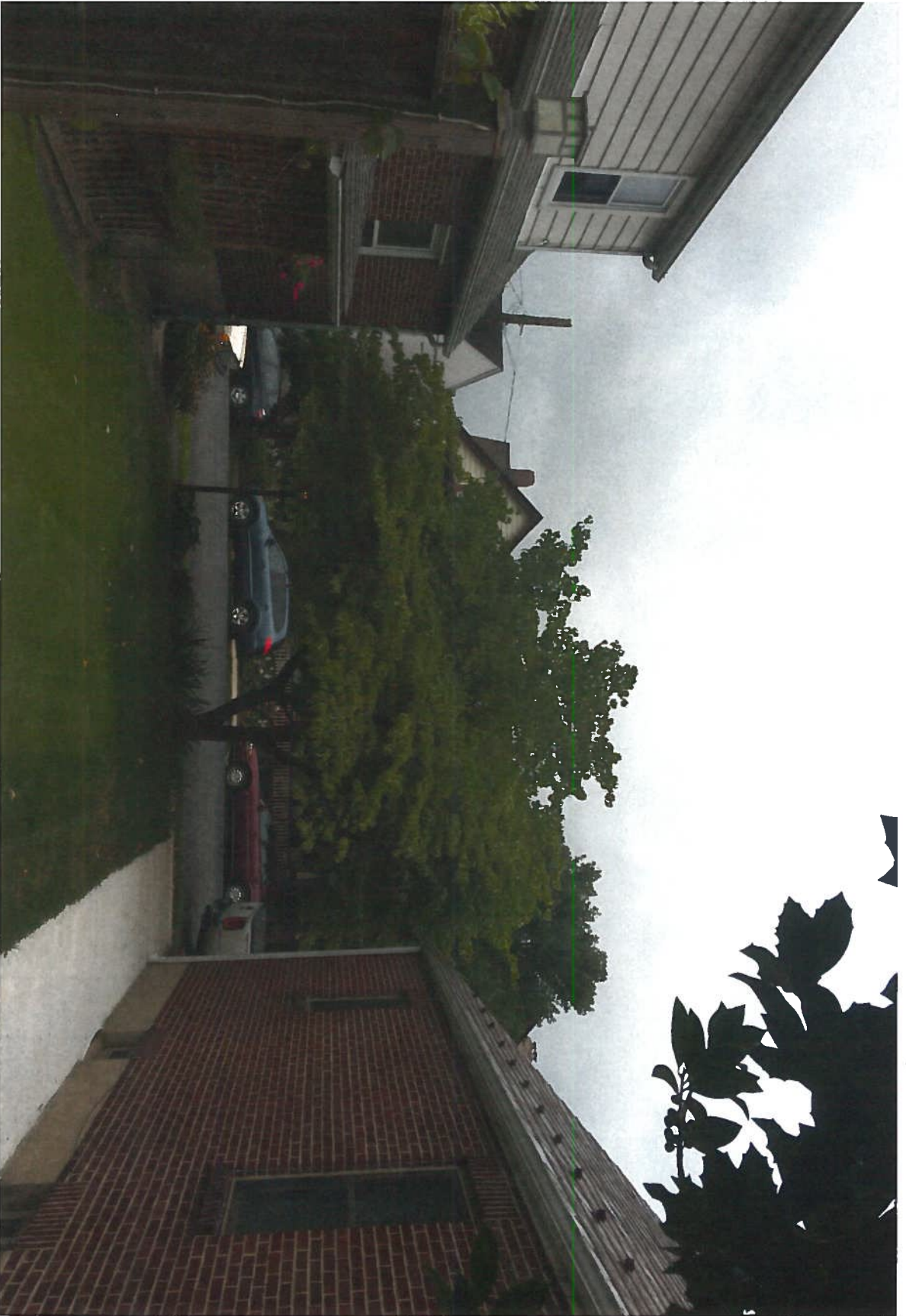
View looking back into the street. Neighbor's home can be seen on the left and Applicant's home on the right.