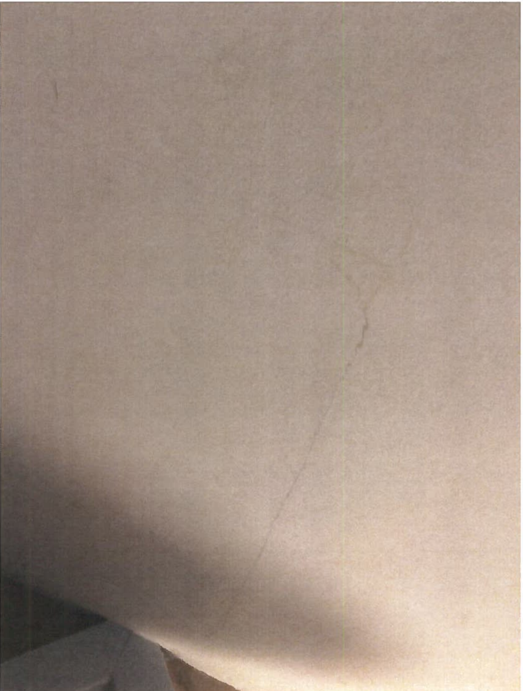
Additional Water Damage seen in second floor ceiling