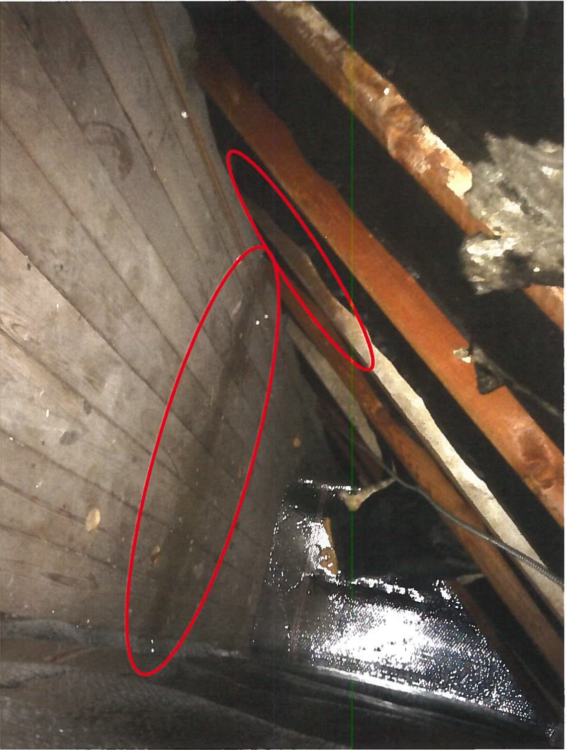
Water Damage in Crawl Space of Attic