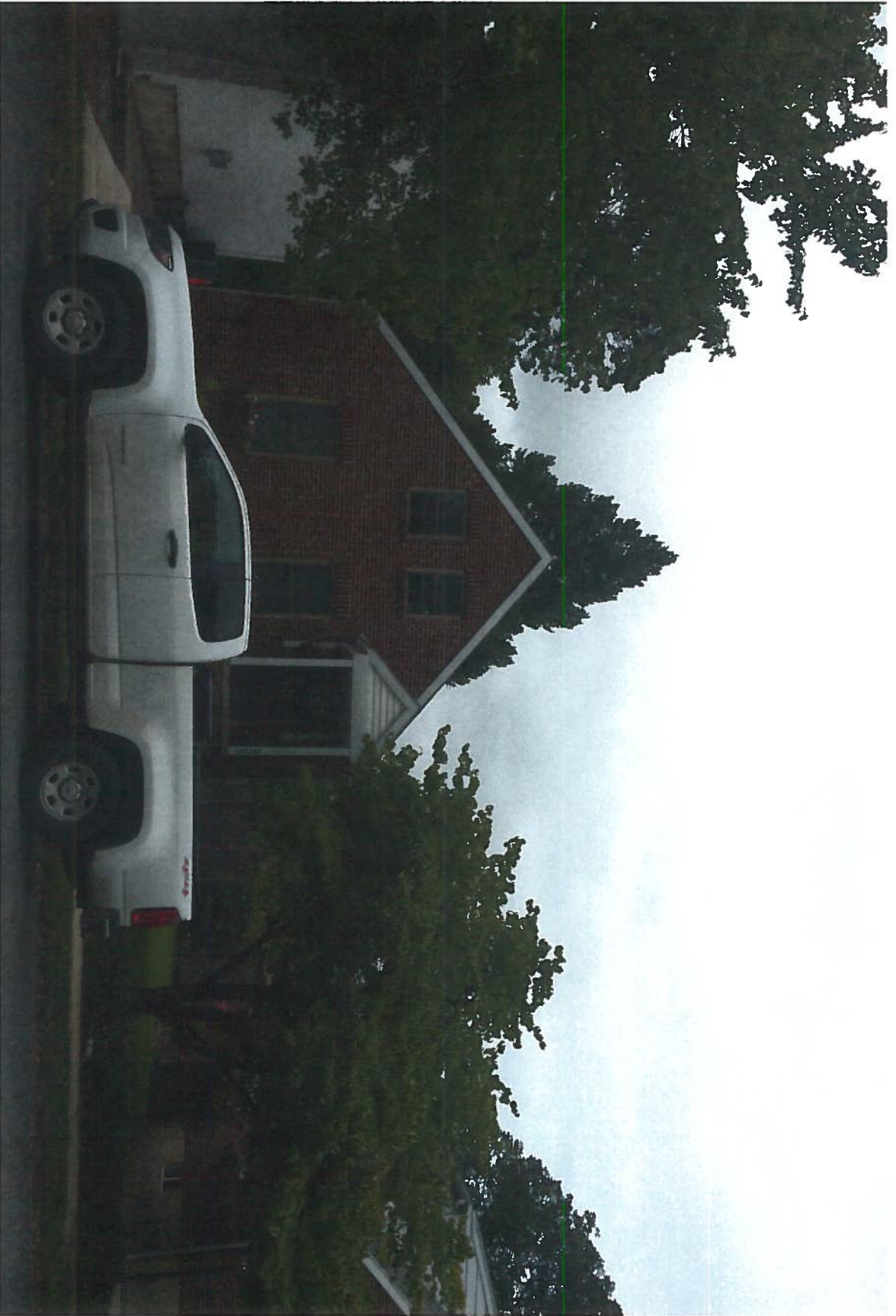
Exterior View of home and immediate neighbors