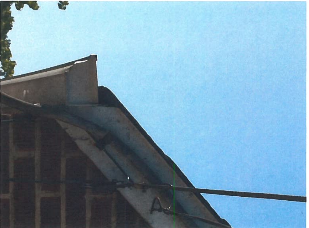
Side view of slates not flush with the gutters (has led to water seepage down the brick siding and through a first-floor window).